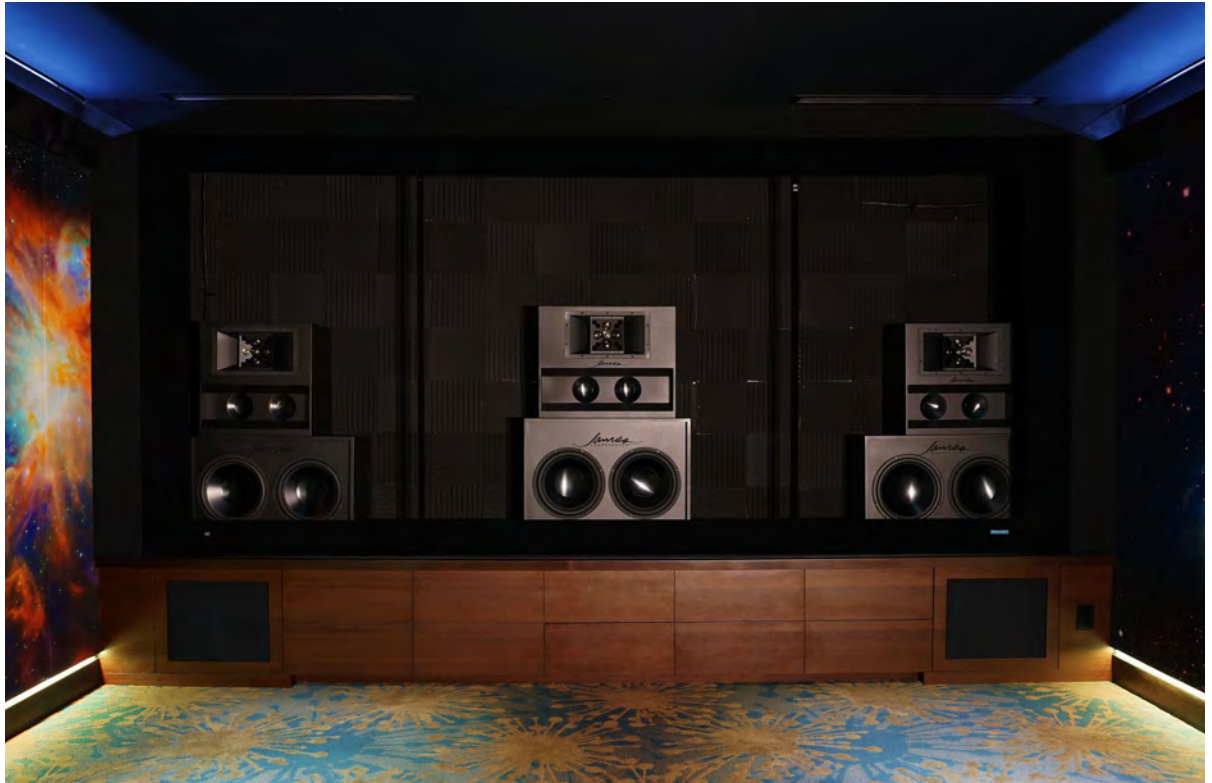
James Loudspeaker Mavericks front stage cinema speaker system

The James Loudspeaker 806BE, used for the side, rear and ceiling channels in this theater, is a sealed cabinet, in-wall reference loudspeaker featuring advanced, high-output drivers set into an aluminum