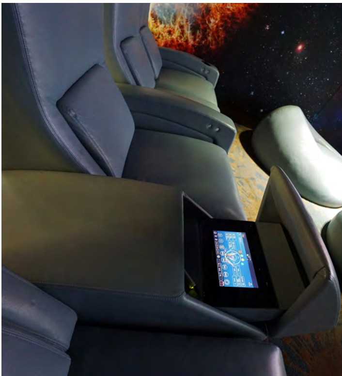
Removable user interface embedded within the seating

interconnects, power cables and speaker wires were cut to custom length and hand-terminated to create the neatest, most reliable finished product. Theater seating is by Fortress and Epic Sky Technology provided a replica of the solar system including specific constellations in the ceiling. The C Global team is quite adept with fabrication and made custom HVAC registers that also house LED lighting used for both ambience and as “work lights.” They also manufactured the hush box for the sizable projector and laser light show hardware, which is used to entertain guests as the projector is warming up.