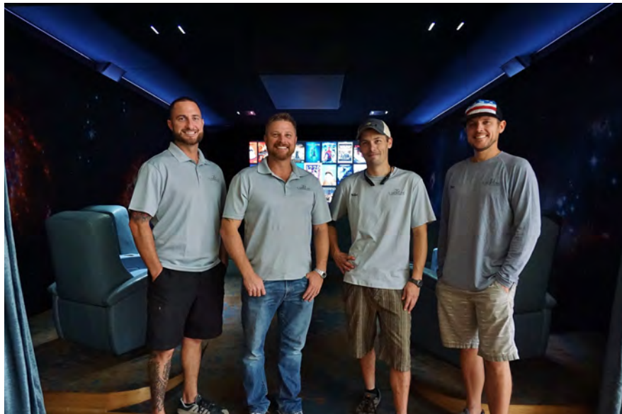
The C Global, Inc. team