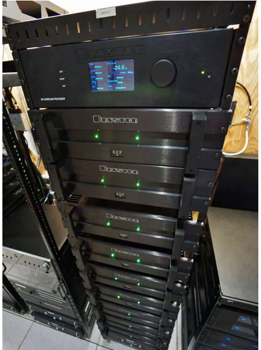
The SP4 processor sits atop nine Bryston Cubed-Series amplifiers

Zack Clark and his team at C Global Inc. were tasked with designing and installing a 7.1 cinema for a client in Southwest Florida some years ago. In the present day, the C Global team was summoned again, upgrading the theater to include immersive surround capability. The homeowner dedicated a 433 square foot space off the foyer with an ample equipment room behind the theater that also houses other smart home devices. The C Global team proceeded to acoustically treat the space by reinforcing the walls and applying AcousticBlok to the floor and wall behind the screen, as well as dense padding to all remaining wall surfaces. With the space prepared, the objective was to create an outstanding audio/video experience that could be used for movies, television and the client's allegiance to their favorite baseball team. After considering the allotted space, available technology and the client's expectations, C Global Inc. decided on a 9.6.1 cinema design featuring a Bryston SP4 surround preamp/processor and Bryston Cubed-Series amplifiers.