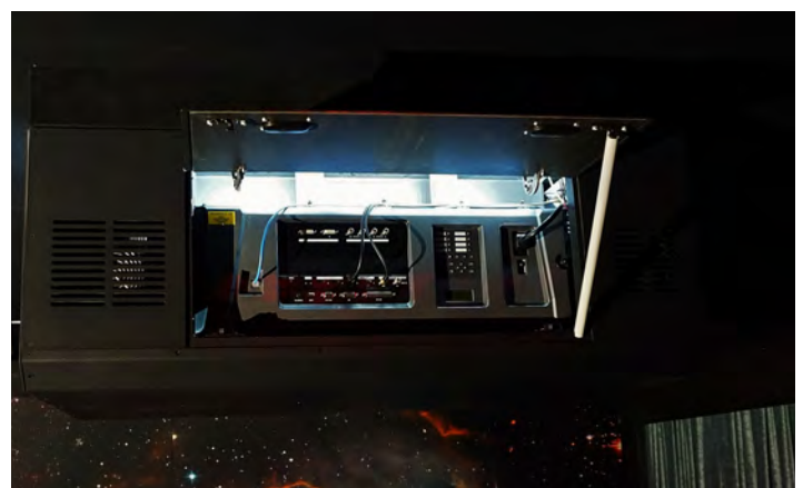
Projector hush box with service access