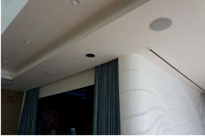
James Loudspeaker in-ceiling speakers

The Southwest Florida residence also includes 14 zones of whole-house entertainment featuring James Loudspeaker QX Series architectural speakers and PowerPipe subwoofers.