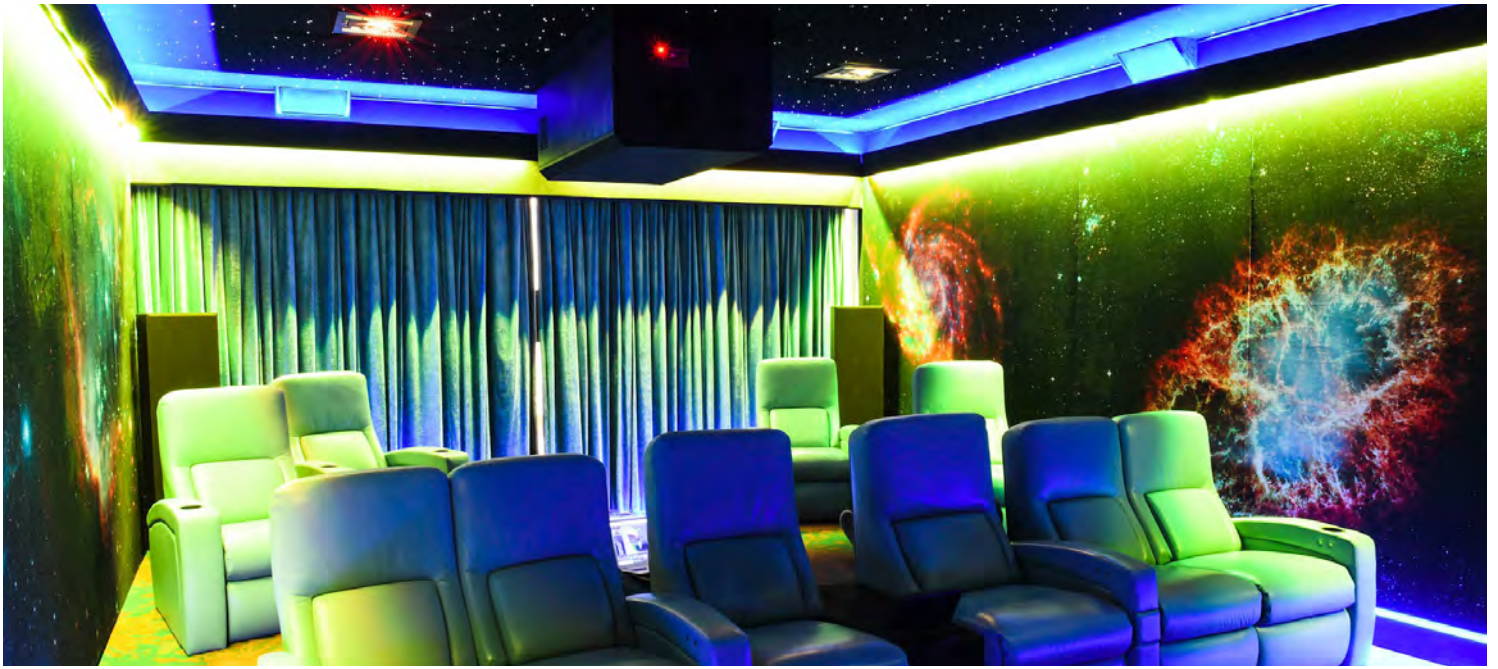
Rear, side (behind décor panels) and height channel speakers