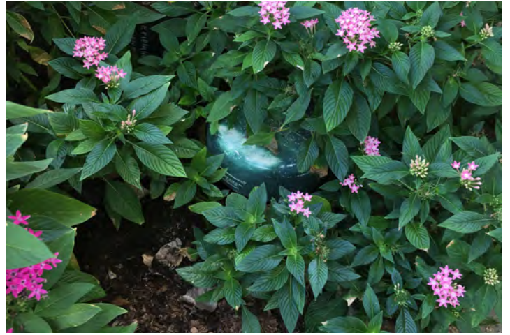
James Loudspeaker landscape subwoofer

There are outdoor entertainment speakers from James Loudspeaker as well serving the patio and Tiki Bar. The whole-house entertainment speakers are driven by multi-zone amplifiers from Crestron. The home also features a high-performance turntable and 2-channel