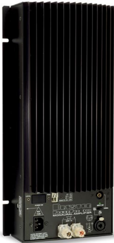
POWERPAC 300 SST