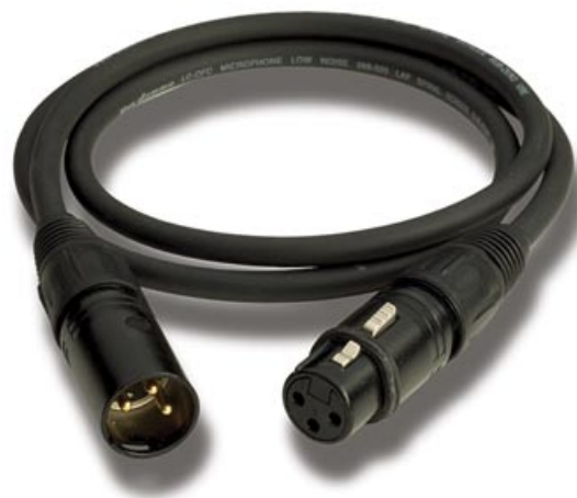
BRYSTON BALANCED XLR CABLE

Video cables also operate at very high frequencies - typically 5-6 MHz for Composite and S-Video and 8-30 MHz for Component Video depending on the scan rate and resolution. So again understanding the wavelengths of the signals and interfaces involved is important.