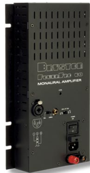
POWERPAC 60 ST