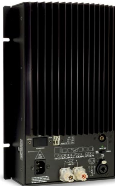
POWERPAC 120 SST