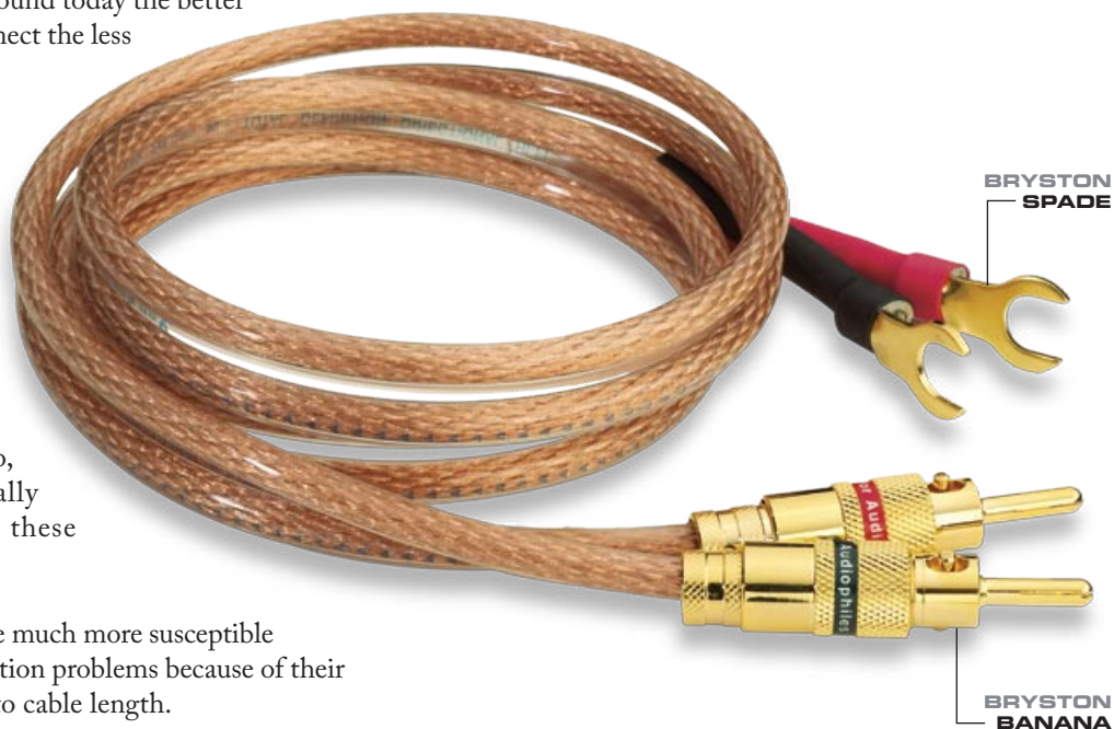
BRYSTON SPEAKER CABLE

Bryston highly recommends keeping the speaker wires as short as possible and utilizing XLR balanced lines if available. Given the choice of long interconnects and short speaker leads or short interconnects and long speaker leads – choose long interconnects (preferably Balanced) and short speaker leads. With digital and video cables finding out the sending and termination requirements is very important due to the very short wavelengths relative to cable lengths involved.