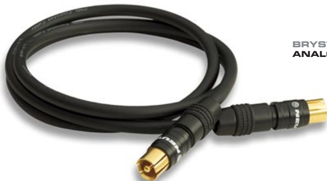
BRYSTON ANALOG/DIGITAL/VIDEO CABLE

We at Bryston, do not think cables should be 'voiced' to sound a specific way. The best cable is NO cable at all so we contend that the best cable is the cable that changes the signal the least.